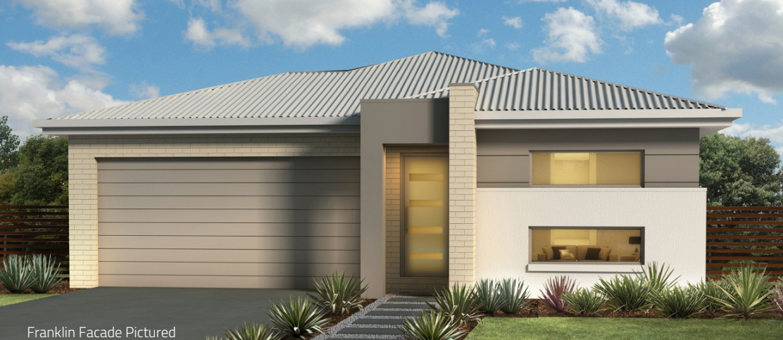
Franklin Facade Pictured