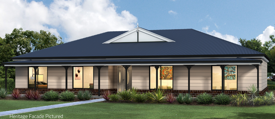
Heritage Facade Pictured