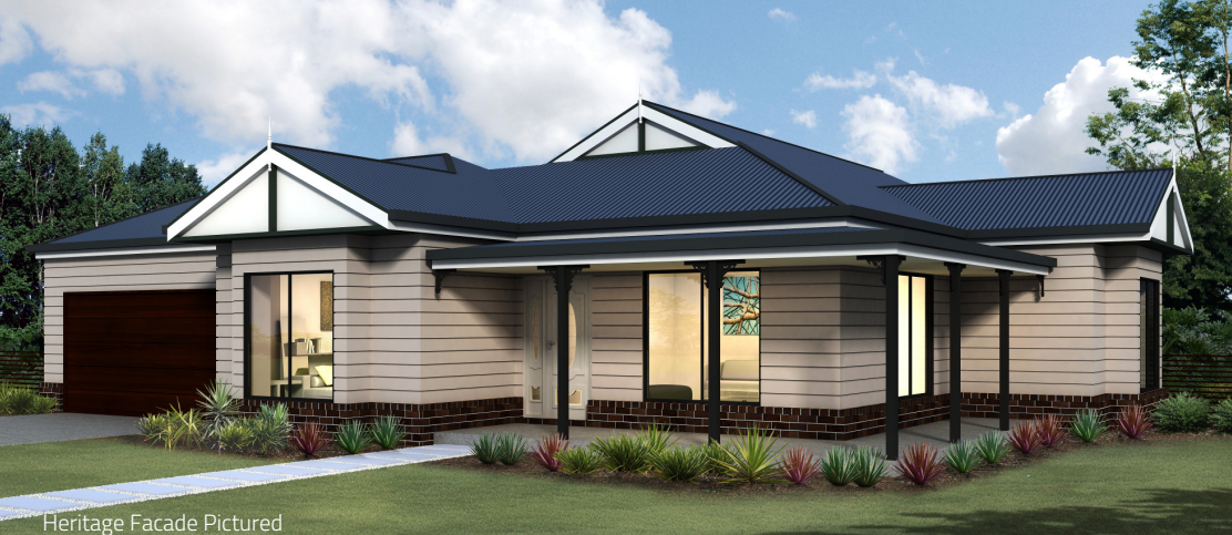
Heritage Facade Pictured