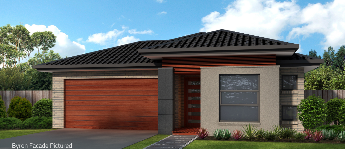
Byron Facade Pictured