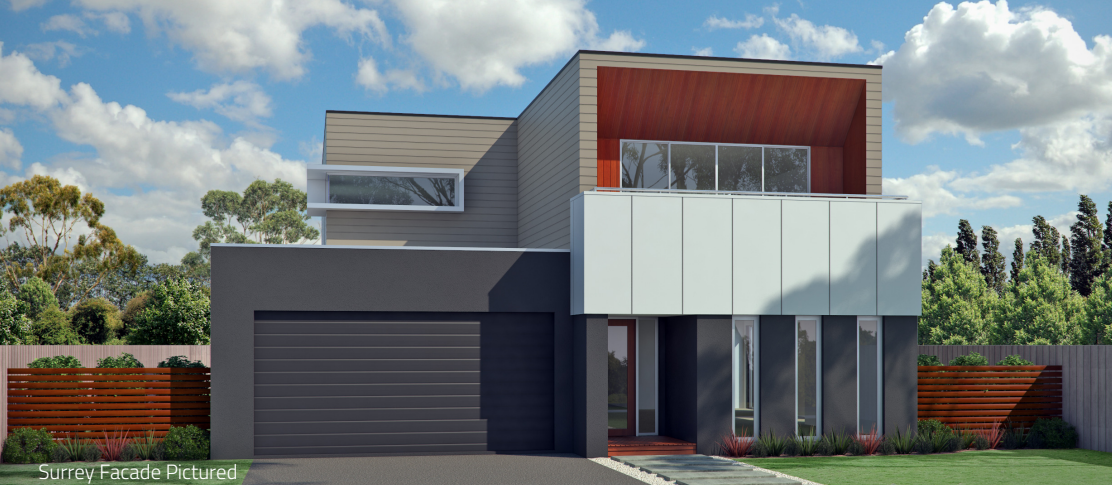
Surrey Facade Pictured