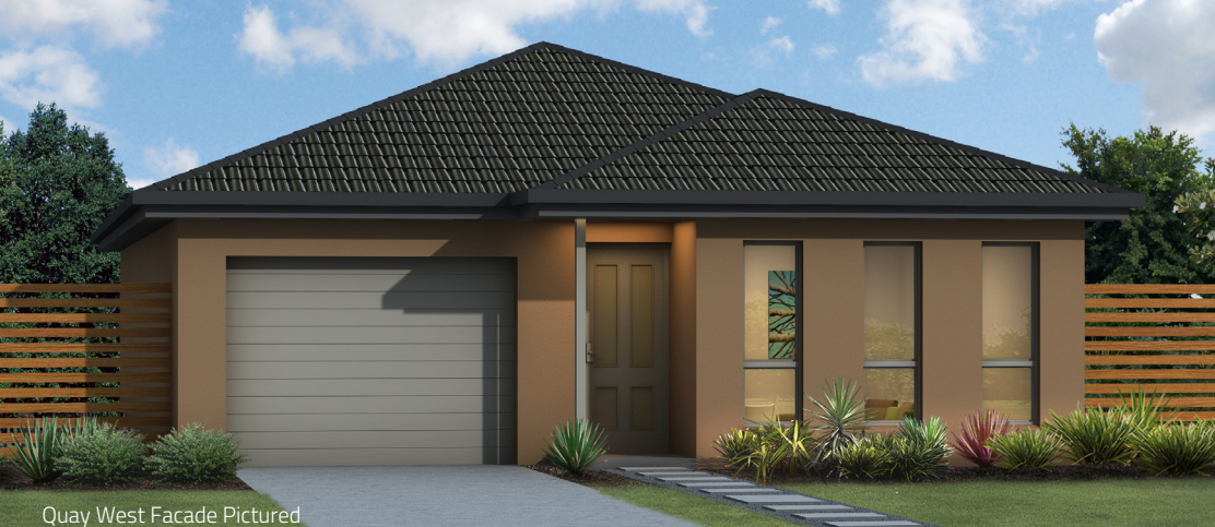
Quay West Facade Pictured