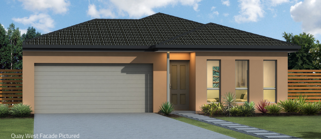
Quay West Facade Pictured