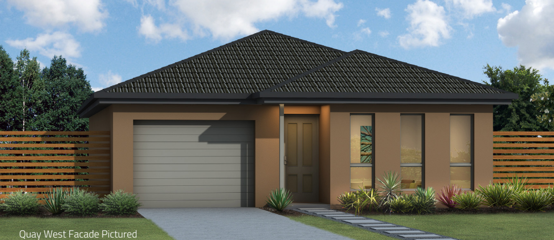
Quay West Facade Pictured