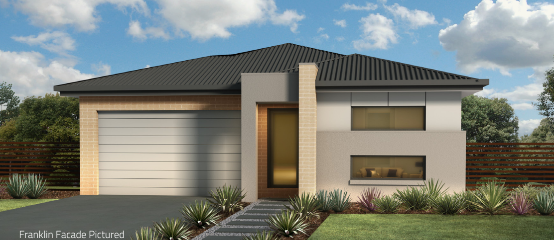
Franklin Facade Pictured