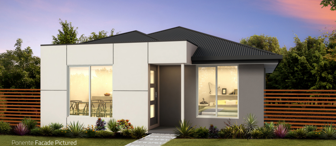
Ponente Facade Pictured