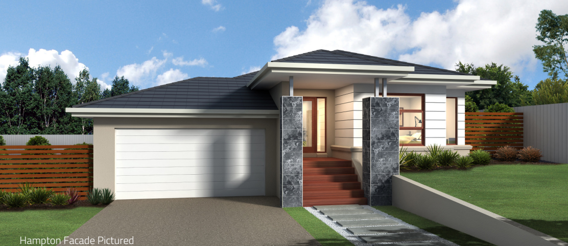
Hampton Facade Pictured