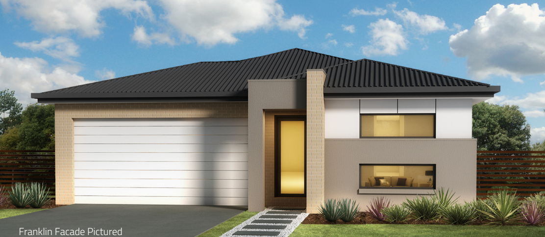
Franklin Facade Pictured