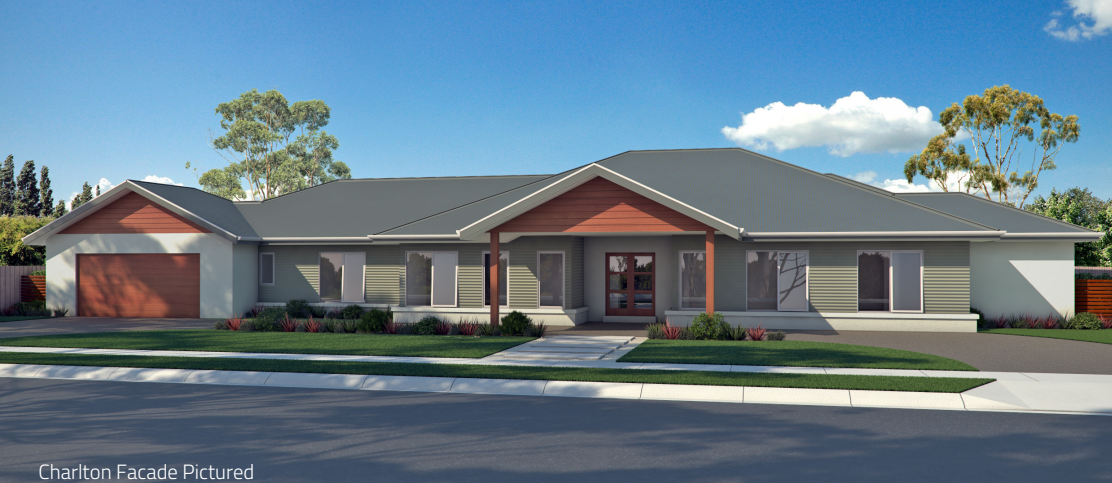
Charlton Facade Pictured