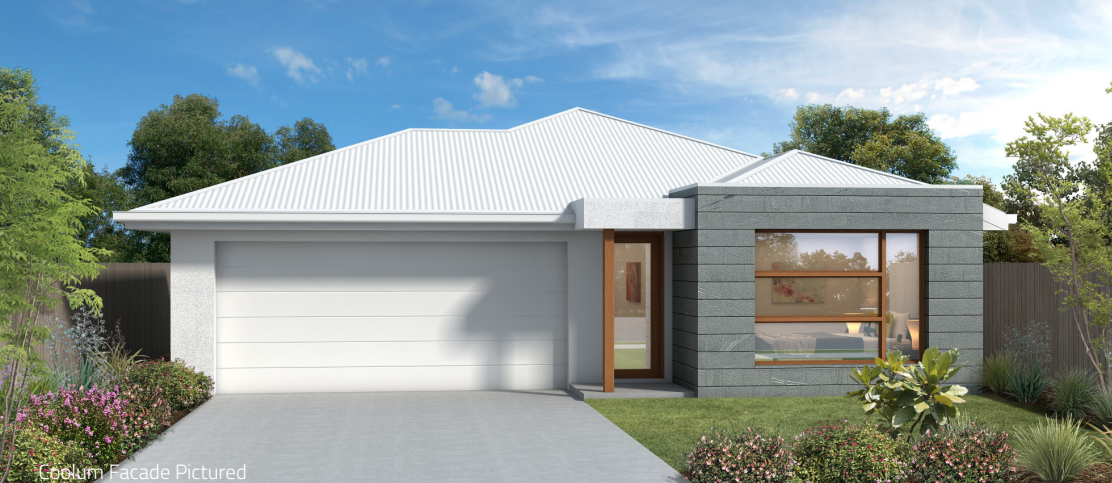
Coolum Facade Pictured