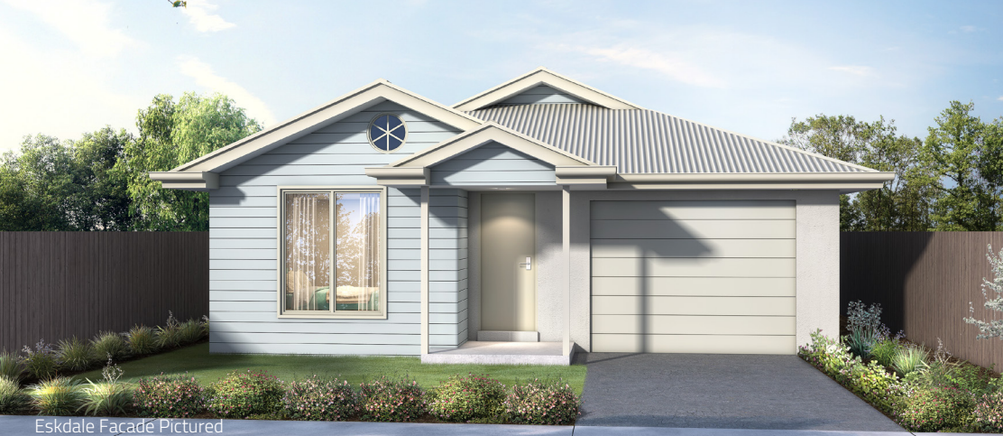
Eskdale Facade Pictured