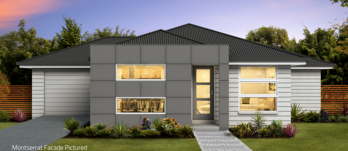
Montserrat Facade Pictured