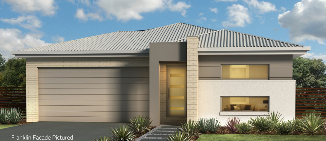
Franklin Facade Pictured