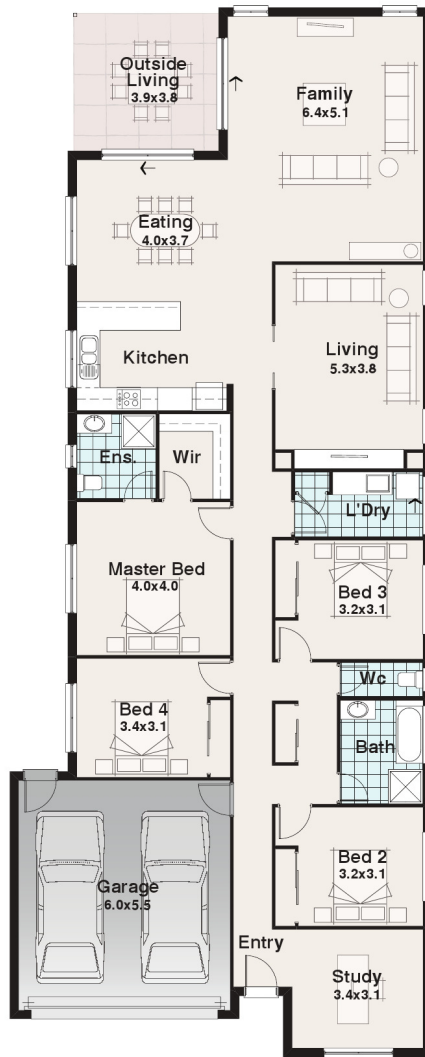
Alternate Tathra Facade Pictured