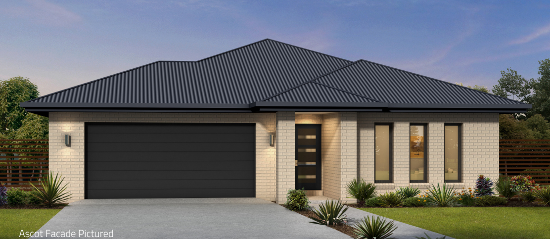
Ascot Facade Pictured